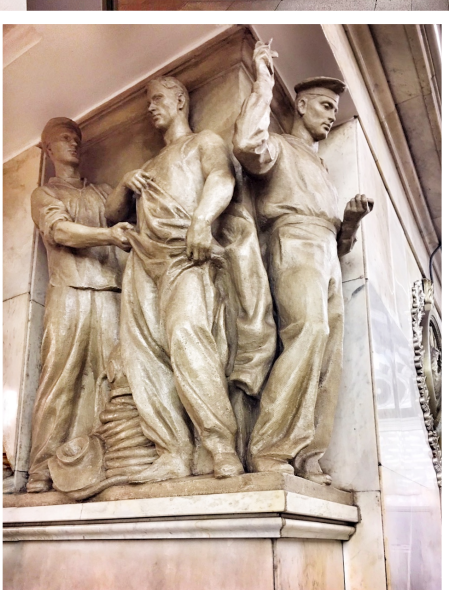
Clockwise from top left and right: Platforms of Narvskaya Station; Ticket office at Avtovo Station; Bronze capitals on pillars at Kirovsky Zavod Station; Sculpture in Narvskaya Station; Sculpture of Red soldiers in Narvskaya Station; Sculpture of school children in Narvskaya Station; Sculpture of seamen in Narvskaya Station; Bust of Lenin in Narvskaya Station