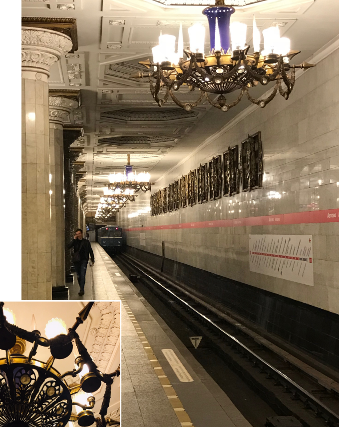
The ornate pillars and chandeliers of Avtovo Station

Kirovskiy Zavod, Devyatkino, Narvaskaya, and the Technologicheskiy Institut Stations.